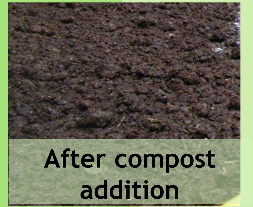
After compost addition