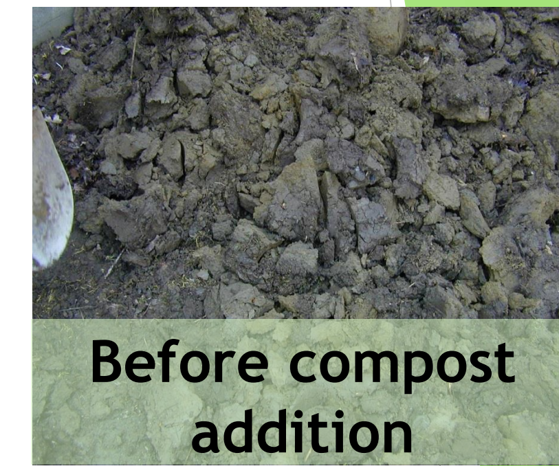
Before compost addition

Compost reduces the bulk density of damaged soil.